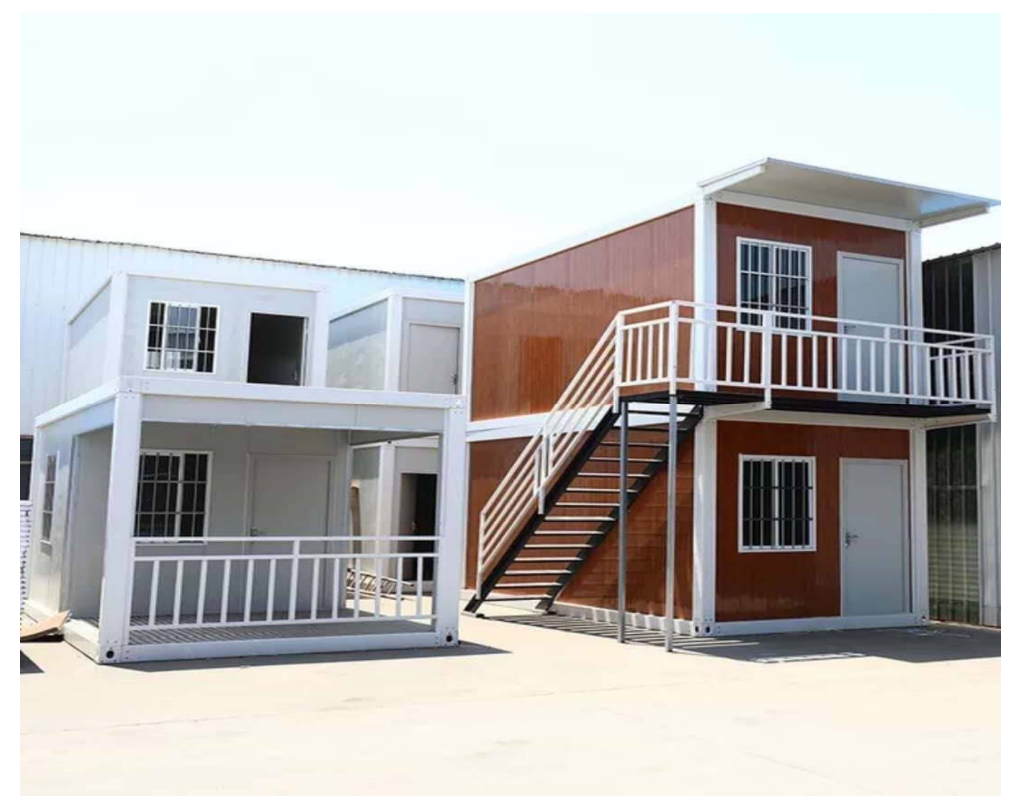
We can customize to reach higher level finishing.